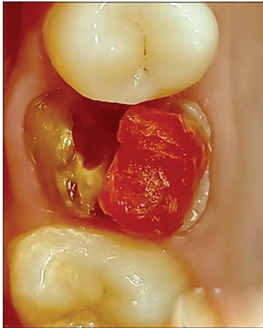
Figure 4: Palatal pattern core buildup.

post and core were reinserted first into the palatal and then the mesiobuccal canal to ensure proper alignment of the