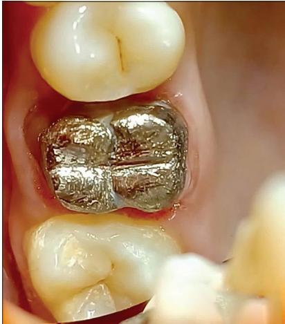
Figure 9: Cementation of cast metal post and core.