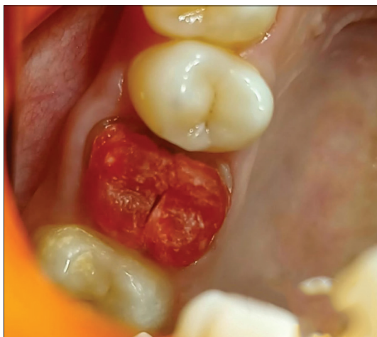
Figure 6: Approximation of buccal and palatal post and core buildups.

split pattern core buildups with the remaining tooth surfaces [Figure 6]. Separate resin patterns for each canal were sprued, invested, and cast in a base metal alloy using conventional lost-wax technique [Figure 7]. After casting, adjustments were made to ensure the cast post and core fit smoothly through the canal pathways [Figure 8]. Each post was individually adjusted to fit securely within its canal, followed by cementation using resin cement once final adjustments were completed [Figures 9 and 10]. Finally, a full coverage PFM crown was fabricated and cemented using type 1 glass ionomer cement [Figure 11].