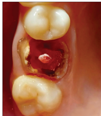
Figure 3: Palatal post pattern.