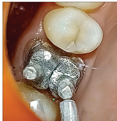
Figure 8: Insertion of cast metal post and core.