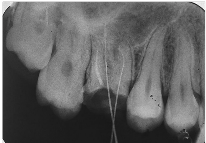
Figure 2: Retrieved gutta-percha 4–5 mm apical to seal from palatal and mesiobuccal canals.

The root canals were prepared using Gates Glidden drills and piezo reamers, and gutta-percha was partially removed from the palatal and mesiobuccal canals, leaving 4–5 mm for apical sealing [Figure 2]. A post pattern was crafted using auto-polymerizing pattern resin (GC pattern resin 1-1), beginning with a lightly lubricated palatal canal [Figure 3]. A thin cylindrical dowel shape was formed using pattern resin, gradually adding resin with a bead brush method until the pattern post fit snugly in the canal. It was repeatedly inserted and removed until the resin reached final polymerization, with undercuts removed using a scalpel. The post was tapered from occlusal to apical. This process was repeated for the mesiobuccal canal. The completed post pattern allowed easy insertion and removal without binding in the canal. Additional pattern resin was used to construct the core, starting with the insertion of the palatal post followed by the mesiobuccal canal. Both were removed after complete polymerization [Figures 4 and 5]. The pattern