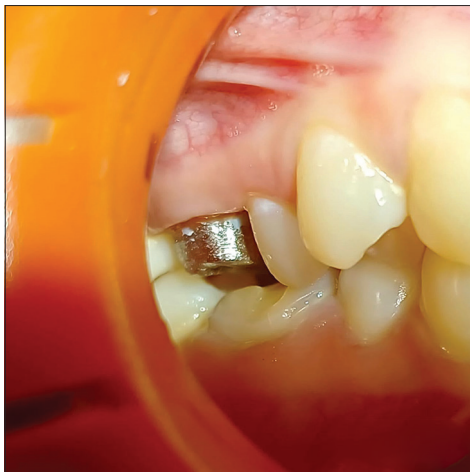
Figure 10: Occlusal clearance for porcelain-fused-to-metal crown.