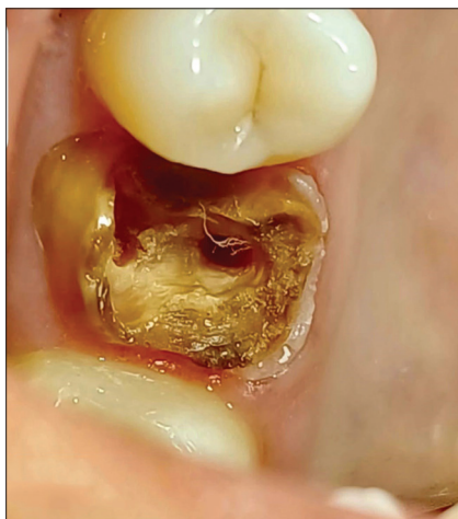
Figure 1: Maxillary first molar.

Due to the significant undermining of the palatal wall of the crown [Figure 1], the treatment plan involved restoring the tooth with a custom-made cast post and core followed by a PFM crown. Given the divergent roots, a split cast metal post and core approach was selected.