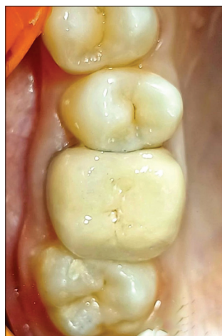
Figure 11: Porcelain-fused-to-metal crown cemented wrt 16.