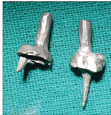
Figure 7: Cast metal post and core.

A non-vital tooth typically suffers substantial loss of tooth structure from previous restorations, caries, and access preparations for root canal therapy. Therefore, it requires a restoration and prosthetic treatment that conserves and supports the remaining tooth structure. [4] The protective feedback system is lost from the teeth when the pulp is