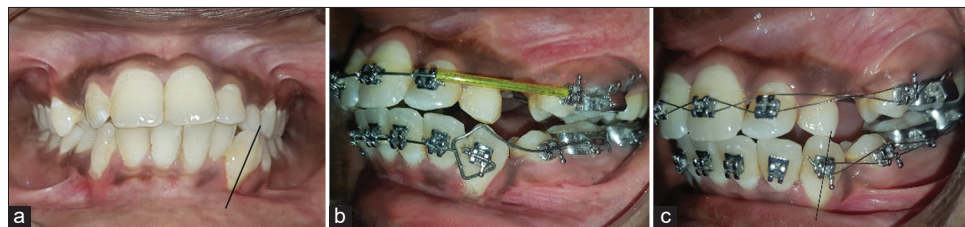
Figure 2: A 21-year-old female patient with Angle's Class I malocclusion with canine relationship not established on both sides along with bimaxillary protrusion and rotations present in both maxillary and mandibular arch. (a) Pre-treatment intraoral photograph shows left mandibular canine rotated distobuccally. (b) Box loop made with 0.016 × 0.022 TMA wire is ligated on the left mandibular canine for segmental approach. (c) Rotation of canine is corrected after two activations.

The permanent canines are very important teeth in the arch. The eminence of the canine gives esthetic character to the smile. Their high gingival contour helps in determining the smile line. They also play a major role in functional occlusion. In canine guided occlusion, the mandible is guided during the lateral excursive movements and the temporomandibular joint and the dentition are protected. Therefore, when the canine is ectopically erupted or severely rotated, it is essential to bring the canine to its normal position. [2,3] Several ways have been used to correct the canine rotations. Abuabara et al. in 2008 used a segmented fixed TMA box loop for the correction of rotation of single tooth. [4] The use of TMA wire correction of canine rotation and retraction provides the advantage of controlled force delivery on the tooth and also the benefit of achieving the desired result in a short time period. [5,6]