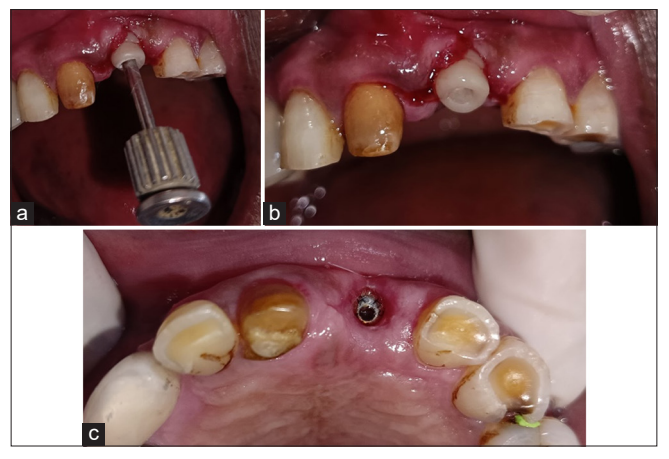
Figure 4: (a) customized healing abutment placed to ensure a smooth surface for soft-tissue contact, (b) custom healing abutment was secured and torqued using a handheld torque wrench, (c) soft-tissue profile after 1-week follow-up through the customized abutment.

ideal esthetics and soft-tissue stability. A thin gingival tissue is more prone to recession and may not provide adequate coverage, leading to compromised esthetic outcomes and difficulty in shaping a natural emergence profile. In such cases, techniques like using a custom-made healing abutment are crucial to optimize the soft-tissue response and enhance the final result. Janakievski<sup>[4]</sup> discussed a similar approach involving the modification of a temporary abutment used as a healing abutment in the anterior maxilla for immediate post-extraction implant placement. The objective in that case was to achieve an ideal emergence profile for the soft tissue to enhance esthetics. Although a temporary abutment could have been used in our case, it would have incurred additional costs.