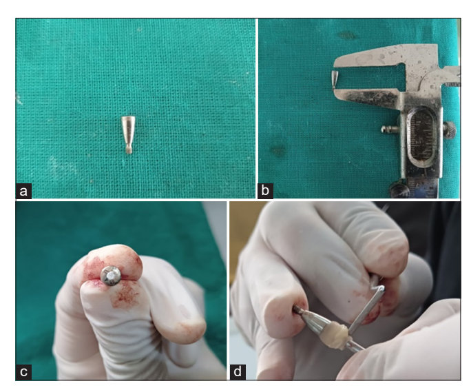
Figure 2: (a) Prefabricated healing abutment, (b) calibrated Vernier calliper for precise measurement, (c) screw access hole sealed with Teflon tape, (d) composite resin was applied circumferentially around the prefabricated healing abutment extraorally.

stability. Excess material was carefully removed using a fine rotary instrument to achieve the desired contour and a smooth finish [Figures 2d, 3a and b].